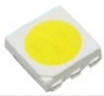
5 KLSL505W 110Lm