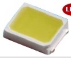
3 2835W 26Lm 65Lm