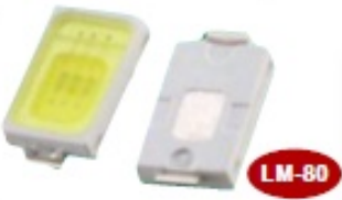
4 KLSL5630W 60/65 Lm