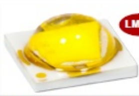
6 KLHP3535W 130Lm