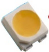
2 KLSL3014W 12Lm