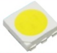
5 KLSL505W 110Lm