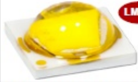
6 KLHP3535W 130Lm